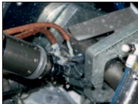
Photo of the drilling operation