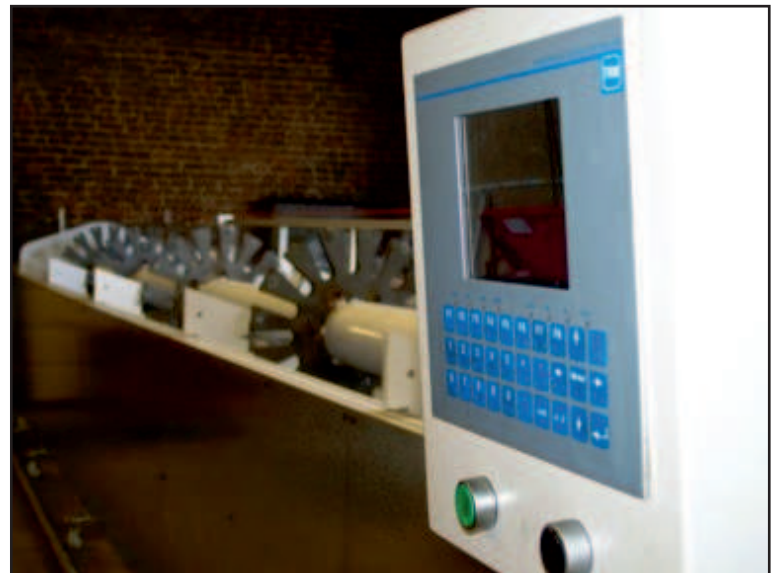
Photo of the 13 metres long machine and TRM 3 axis motion controller.

By using the Motion Application Programme "MAP" our client was able to save money and time in software development. MAP can store many user programs in memory and each program can have a large number of lines (commands). The flexibility of MAP means that very complex programs can be created, in this case the program was 250 lines long.