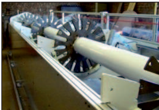
Photo of the 13 metre long tube drilling machine