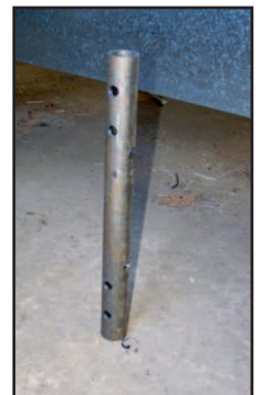
Photo of the finished product